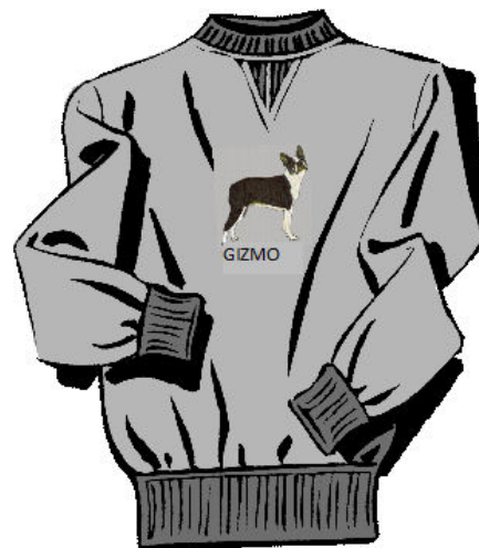
Sample of what they will look like

of color. In addition, there will be a catalog with pictures of most of the popular dog breeds. Not to worry, if the pattern for your dog’s breed isn’t in the catalogue there is a good possibility that Marilyn can order one. In the event your dog is not breed specific there will be a choice of novelty embroideries to choose from.