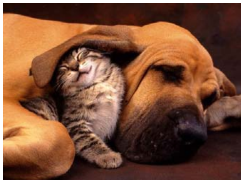
Even cats need some good old fashioned Canine Assisted Therapy

In Napa County, The Animal Shelter will issue a Therapy Dog License, however, from what they tell us there is no difference in the fee.