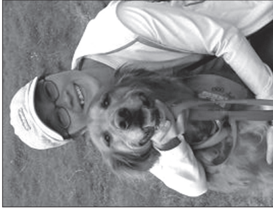
New Adventures for Bof & Siri

NON-PROFIT ORG. U.S. POSTAGE PAID NAPA, CA PERMIT NO. 7