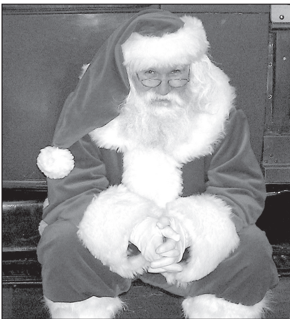
Last year's Santa loved our animals and was the quintessential Mr. Claus.

Two upcoming events mark the end of Paws for Healing's 2008 activities and its first decade of providing canine-assisted therapy teams to local communities.