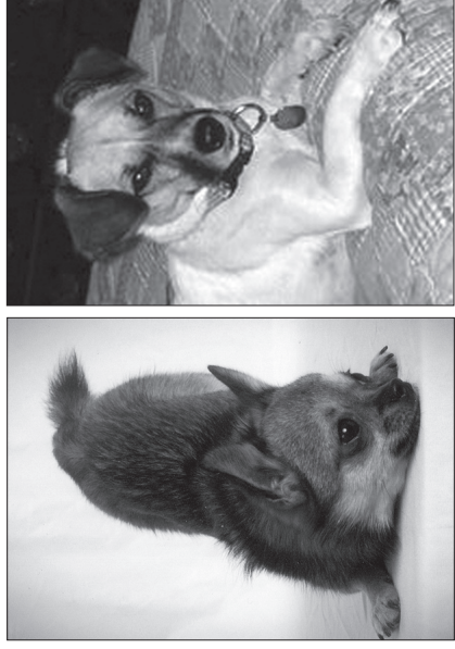
Chris' Pick: Exceptional rescued canines that are PFH volunteers.